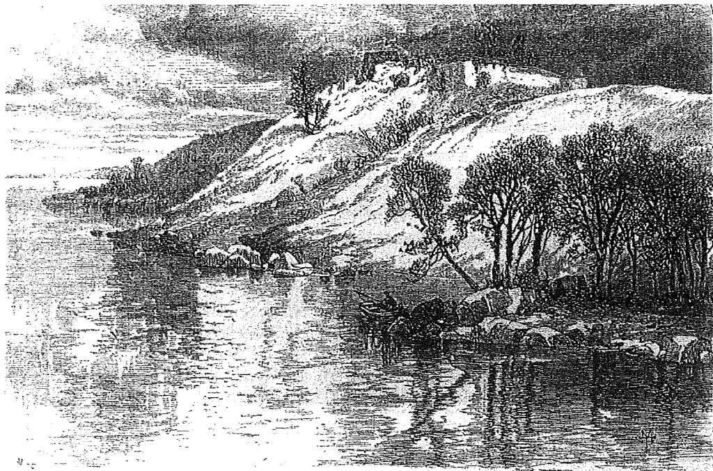
Site of the Narragansett Fort at Fort Neck.

Rural New England is a place which often appears frozen outside of modern times. This is particularly true in the village of Deerfield, where stately houses transport visitors out of the present and into the past. In contrast, archaeology in the Village has revealed the dynamic nature of rural life in 19th-century New England. I use the archaeology from the E.H. and Anna Williams house to probe the concept of the timeless rural world and show how capitalist social processes have led to the creation, alteration and destruction of the landscape of the homelot.